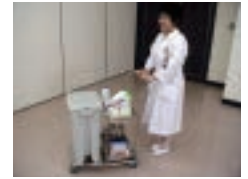
DC-S in use at Kanazawa City Hospital.

*Rubber handle cover is reference use only.