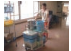
DC-M (Special ordered size) in use at Jukoen, a welfare facility.