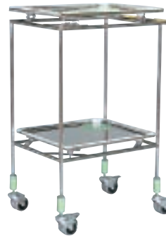
BC-S (Shock absorbing sockets type)