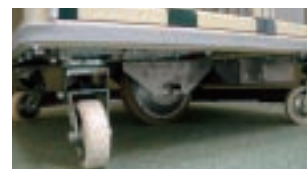
Wheel with electric motor