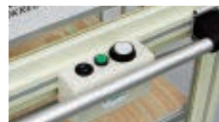
HC-24/ Operation panel