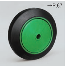
PW (SBR) • with thread guard

See P.62 to P.71 for detailed description.