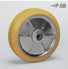
SEUW (Antistatic UR) •Volume resistance 10 6 ~10 9 Ω·cm* *For reference only, not guaranteed.