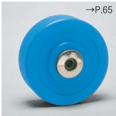
MC (Monomer cast nylon) NB With stopper type: not available