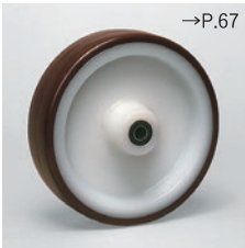
POTH (UR) (Wheel center: Nylon 6) <Made in Germany>