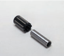
Stainless steel needle bearing