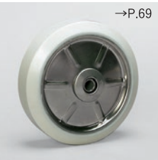
SWUW (Antibacterial UR/White)