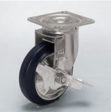
Swivel with stopper SUNJB-150SW