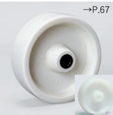
PO (Nylon6) <Made in Korea> PO-100, 125 and 150 <Made in Germany> PO-200 NB With stopper type: not available